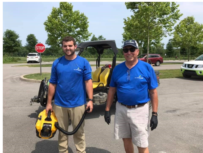
The amazing Parklands staff is on hand to help vacuum up all of the broken glass