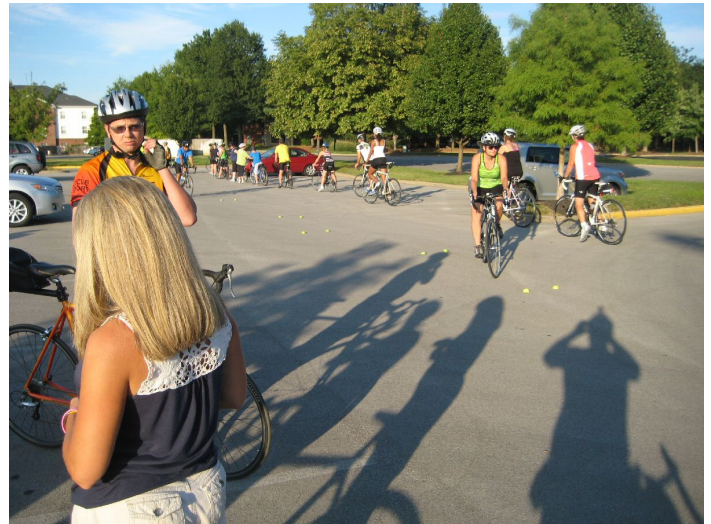
Students go through the Control Weave at the New Rider Clinic.