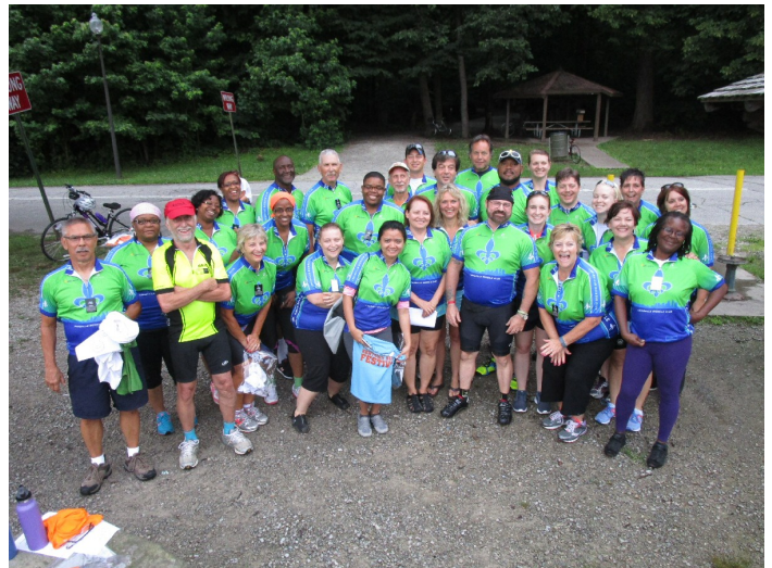
The 2015 Iroquois Park, New Rider Clinic graduating class.

These classes are offered FREE to anyone! Complete the class and receive a one-year membership to the LBC and an LBC jersey. These classes are brought to you courtesy of the Mayor's Healthy Hometown Movement and Baptist Health Sports Medicine. Thanks to our sponsors and the many volunteers!