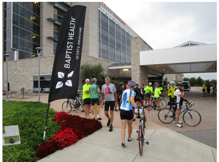
Riders prepare to depart from Baptist Eastpoint.