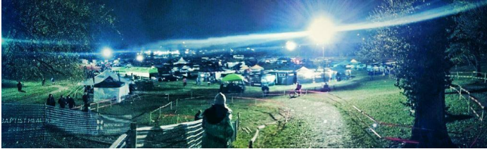
The first night races at Eva Bandman Park drew a great crowd!

In addition to the Derby City Cup, EBP recently hosted the Single Speed World Championships as well as the Short Track Series during the Summer and various training sessions throughout the year.