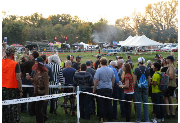
EBP is a great venue for cyclo-cross racing! Metro Parks has done an outstanding job making this park one of the premier cyclo-cross venues in the world!