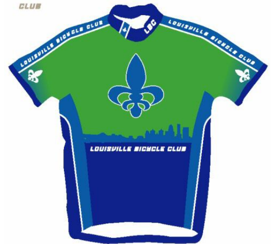
The new LBC Jersey