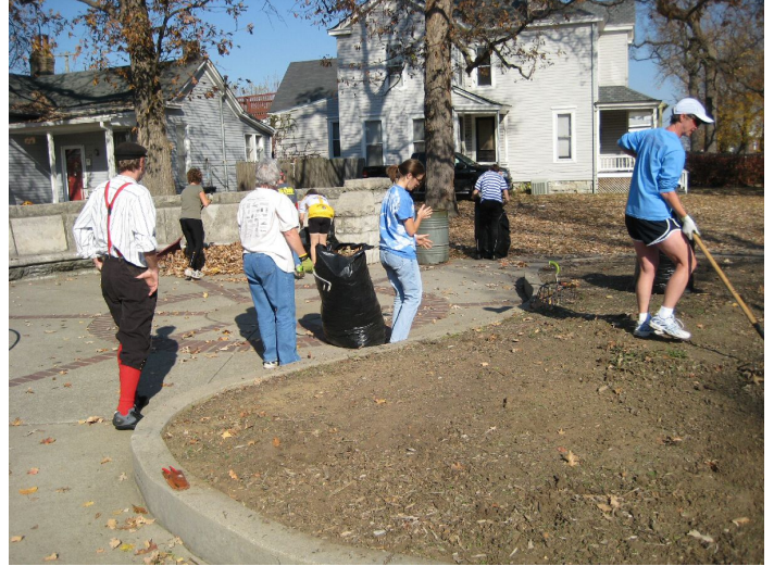
LBC Clean-up crew working at Wayside Park

It was really cool until they dropped me! Here I was on my new fangled Safety Bicycle getting dropped by a bicycle that is 123 years old! It was very cool watching them ride off into the sunset.