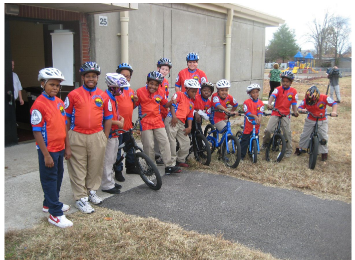
The graduates lookin' good in their new jerseys!