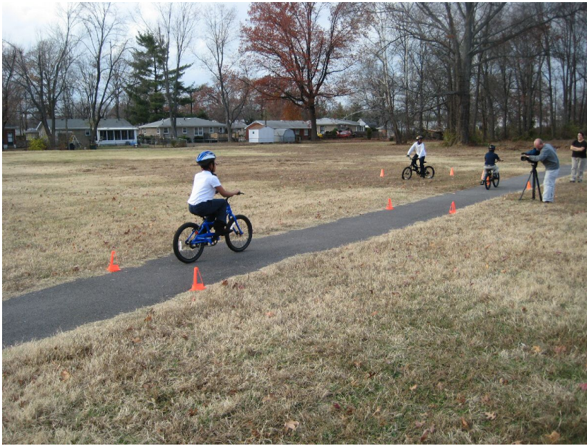
Students on YCPS Test Course