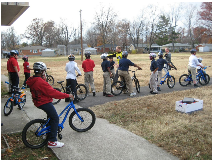
Students receive final instructions as they prepare for their test ride.