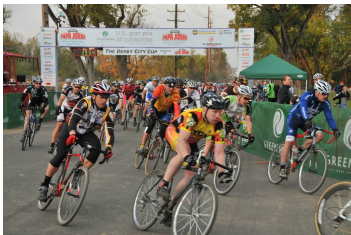
A field of 113 Category 4 racers heads into the first turn in the USGP of Cyclocross at Eva Bandman Park.

We are all looking forward to next year and another productive year for BikeClicks.com / Team Louisville.