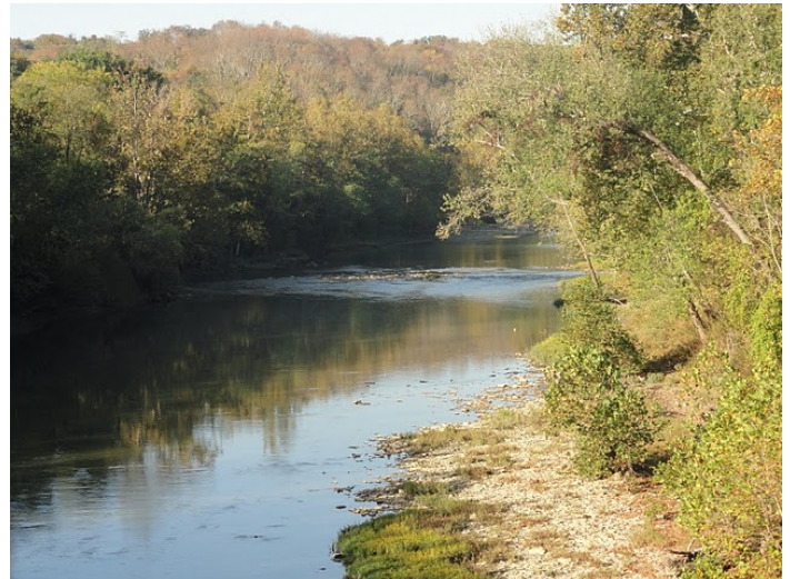
Little Miami River along the Trail