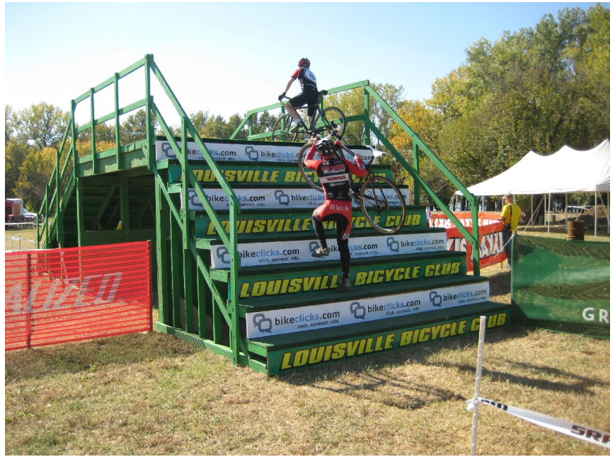
Racers scale The Green Monster at the GREENWARE USGP of Cyclocross.

the GREENWARE USGP of Cyclocross Derby City Cup presented by Papa John's Pizza. This is a wonderful use of an essentially unused city park. Competitors and spectators alike raved about the park. Eva Bandman Park will host the Master's Cyclocross World Championships in 2012 and 2013 as well as the 2013 Elite Cyclocross World Championships, the first time those events will take place outside of Europe. This is another world class bicycling facility we are fortunate to have here in Louisville. The park is open year-round for your cyclocross enjoyment!