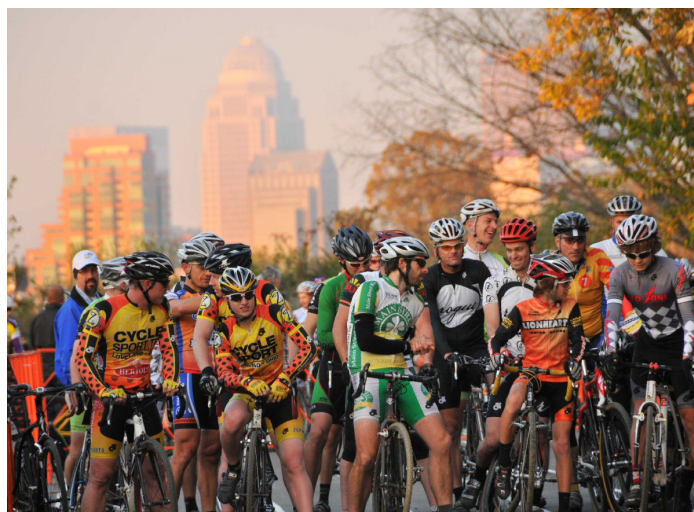
Category 4 racers line up for the inaugural cyclocross race at Eva Bandman Park.