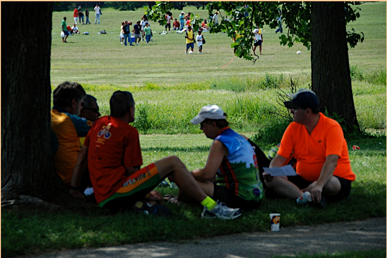
Hayes-Kennedy Park.