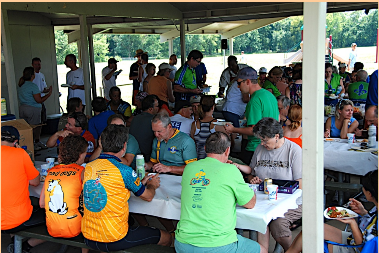
Standing room only.