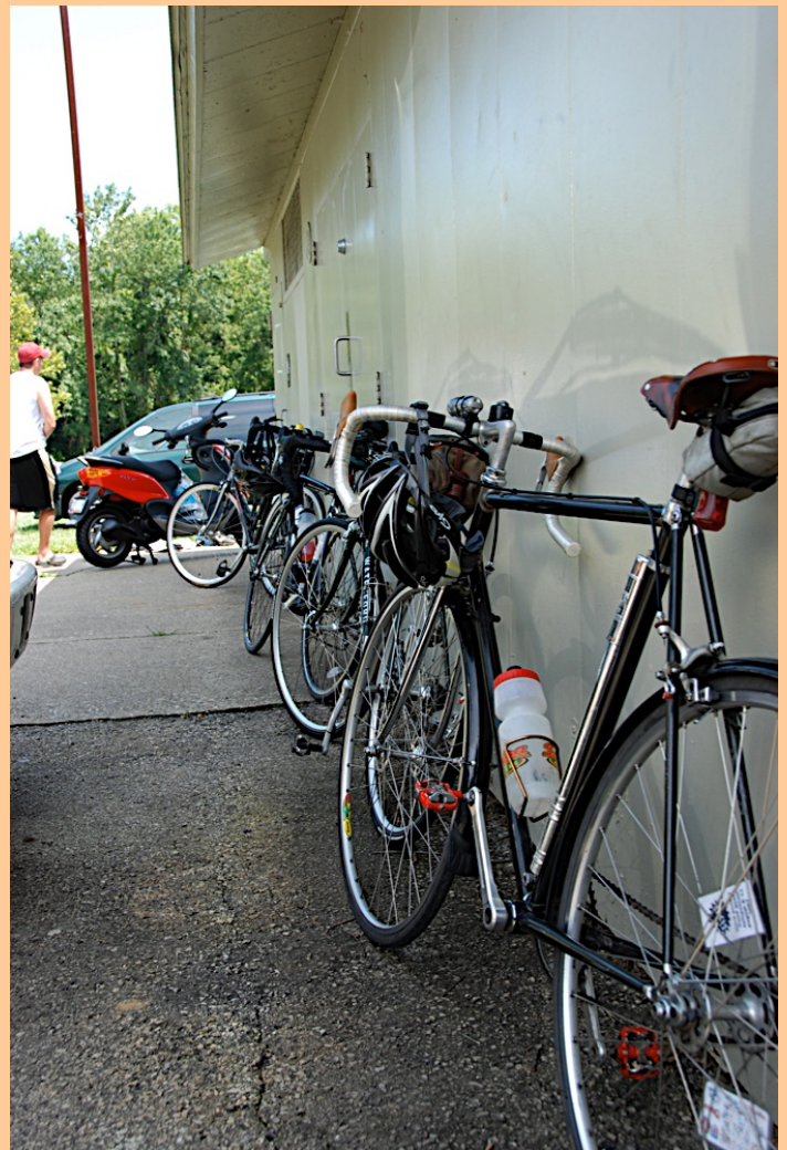
Easy parking for some.