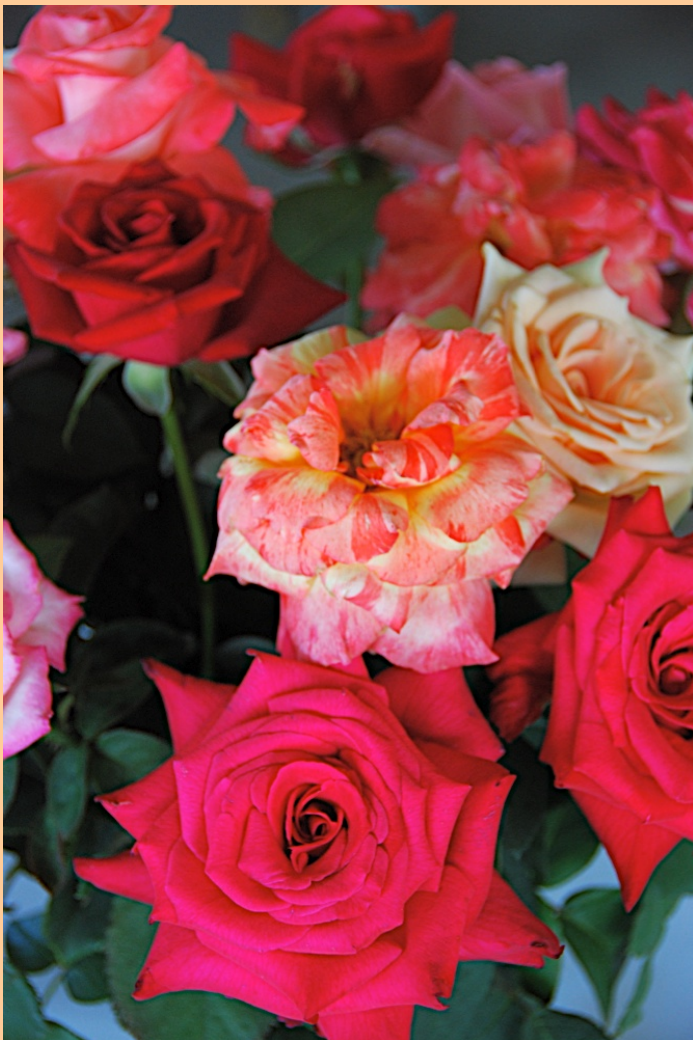
Jim Preston's table settings. (You need the email color version for justice!)