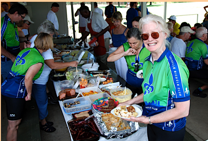
Quite a spread of food from volunteers.