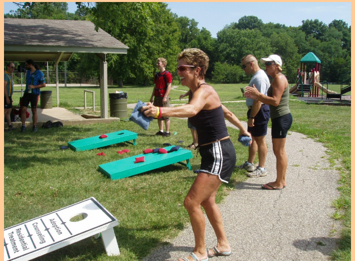
Many enjoyed a bag tossing game.