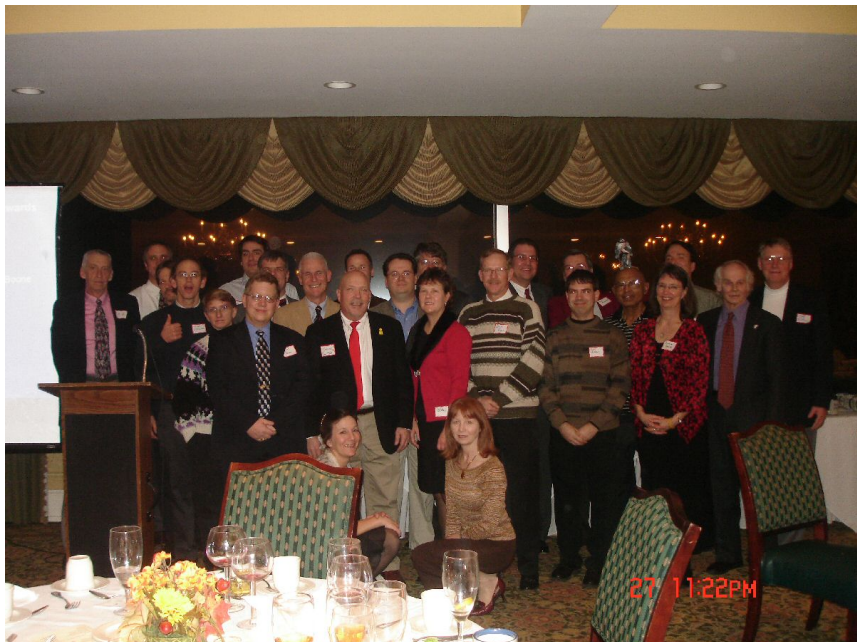
Top Ride Captains (led 10 or more rides in 2006) (photo and information courtesy Jim Tretter)