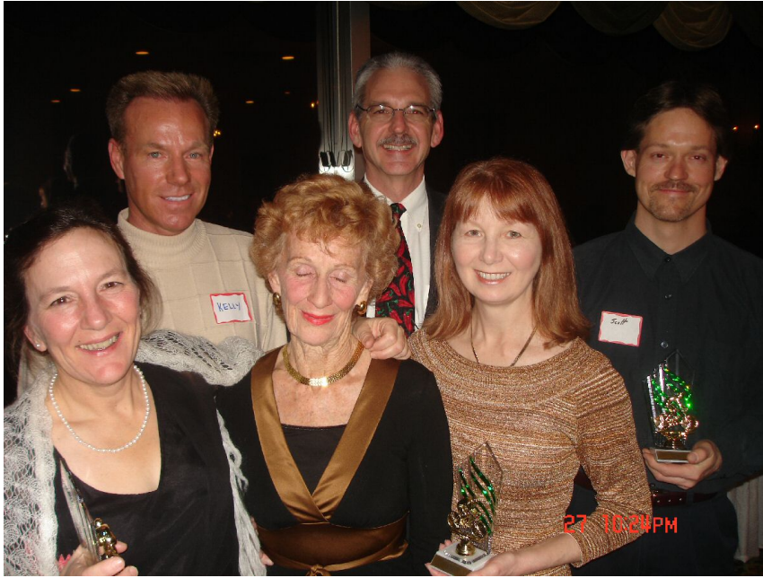
Tour de Mad Dog winners: